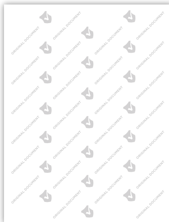
Back artificial watermark pattern appears when rubbed with a coin